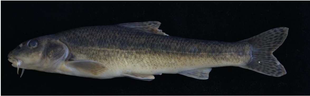
Figure 9. Gobio microlepidotus ; Seydişehir, Stream Kuğulu, 137 mm SL.

Threats: Even though the species from the three independent water sources are known. However, these populations are generally poor. Gobio microlepidotus is the only species in head water of the Göksu River and Stream Limon. Pollution and water abstraction are major threats.