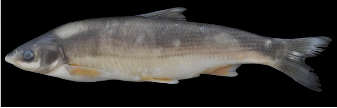
Figure 2. Chondrostoma beysehirense ; Beyşehir, Lake Beyşehir, 209.2 mm SL.

Threats: The predominant threat for the population of Lake Beyşehir is the predator pressure of Sander lucioperca , unregulated fishing methods, pollution of canals and small rivers due to domestic and agricultural wastes and loss of habitat (water shortage in summer).