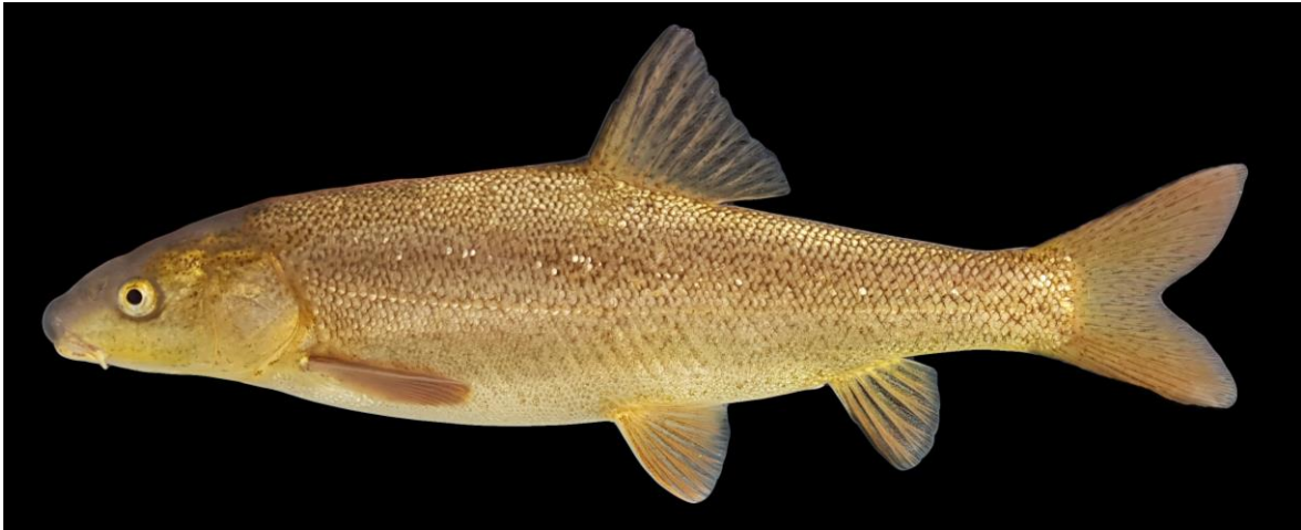
Figure 7. Capoeta mauricii ; Beyşehir; Stream Eylükler, 205 mm SL.

Threats: Capoeta mauricii is endemic to Lake Beyşehir and populations of the species declining according to our in situ observations. Water abstraction is the main threat to the species.