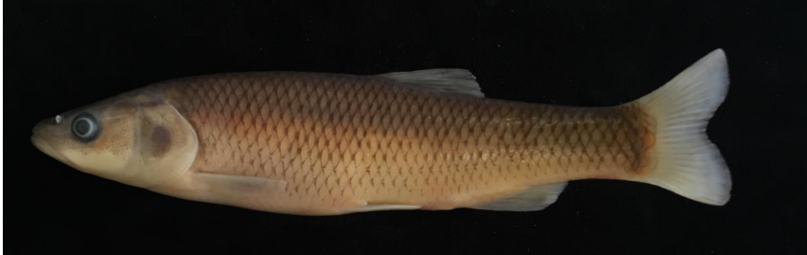
Figure 3. Squalius anatolicus ; Seydişehir, Stream Akçay, 220 mm SL.

Threats: The predator pressure of Sander lucioperca may be effective in part for the population of Lake Beyşehir. There is no significant threat in other distribution areas.