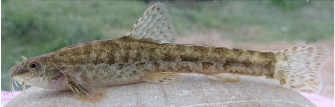
Figure 13. Oxynoemacheilus atili ; Seydişehir, Stream Kuşulu, 55 mm SL.

Threats: Domestic and agricultural pollution and habitat losses are also a threat to the Manavgat River population.