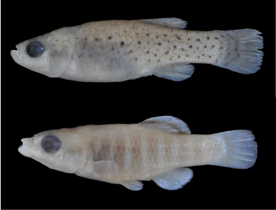
Figure 10. Aphanius cf. iconii ; Beyşehir, Soğuksu Bridge, 41.2 mm SL ♀- 38.2 mm SL ♂.