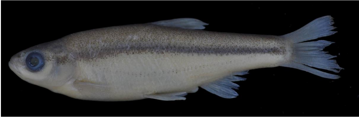
Figure 5. Pseudophoxinus battalgilae ; Seydişehir, Stream Bozkır, 62 mm SL.

Threats: No individuals were found in Lake Beyşehir, which is the type locality. Canals flowing to Lake Suğla and the Stream Bozkır populations are under pressure from pollution due to domestic wastes. There is no significant threat in the Manavgat River basin.