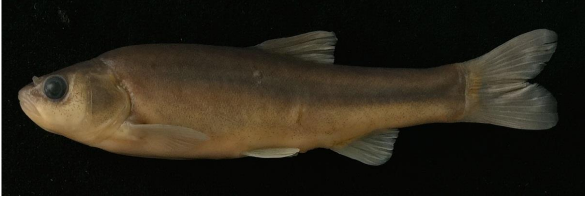
Figure 6. Pseudophoxinus hittitorum ; Beyşehir, Stream Eflatunpınarı, 100 mm SL.