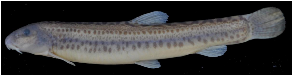
Figure 11. Cobitis battalgilae ; Beyşehir, Stream Eflatunpınarı, 121 mm SL.

Threats: They live mostly in canals and small streams. The threat to the Manavgat River population is currently unknown.