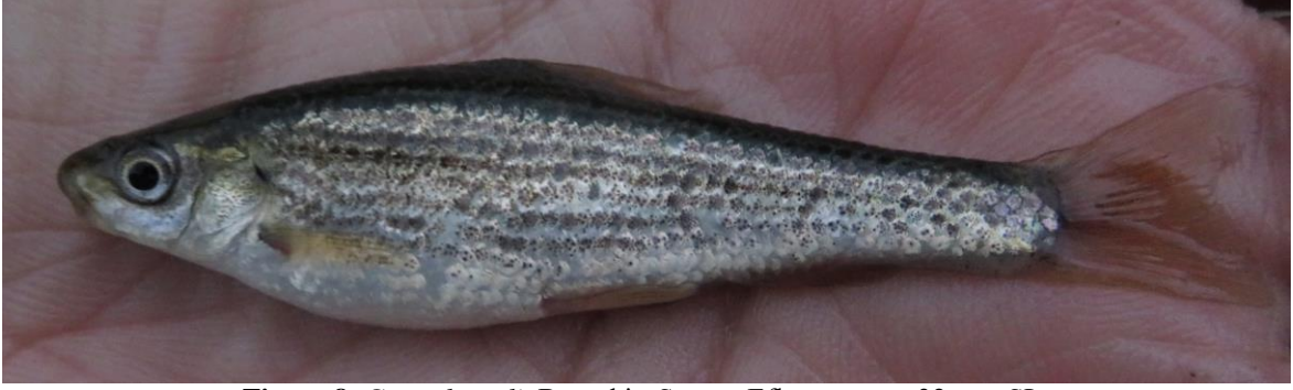
Figure 8. Garra kemali ; Beyşehir, Stream Eflatunpınarı, 32 mm SL.