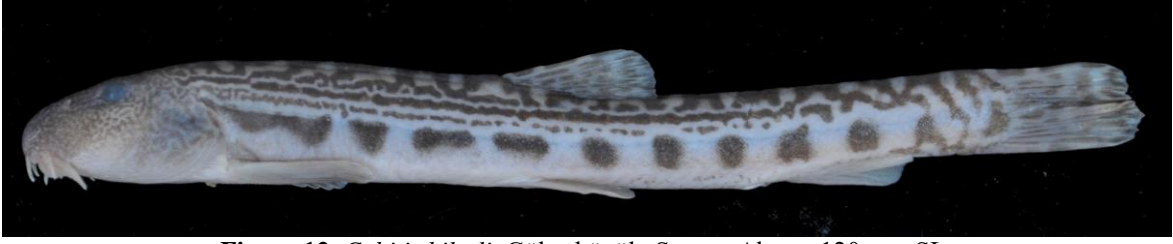
Figure 12. Cobitis bilseli ; Gökçeşhüyük, Stream Akçay, 120 mm SL.

Threats: Domestic and agricultural pollution and habitat losses are also a threat to the Manavgat River population.