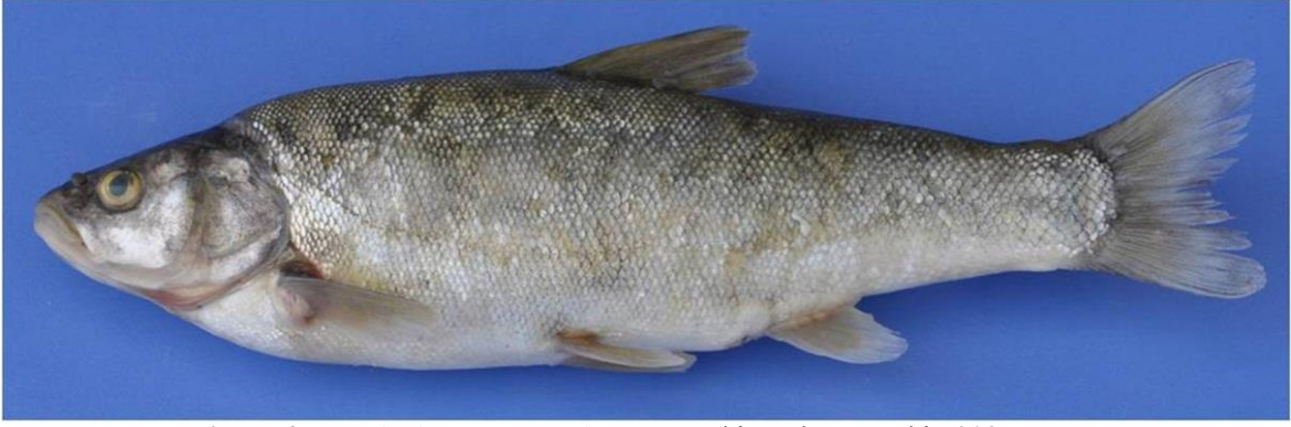
Figure 4. Pseudophoxinus anatolicus ; Beyşehir, Lake Beyşehir, 208 mm SL.