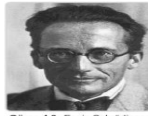
Görse 4.3: Erwin Schrödinger