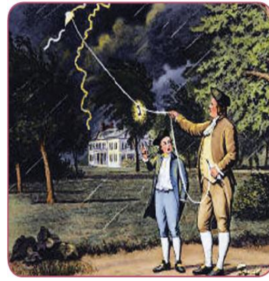
Scientist studying in the nature: symbolic picture of Benjamin Franklin's kite experiment (Hepdođru, 2018, p.276, Visual 6.11., Physics 9, Tutku Publishing).