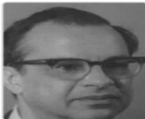
Görsel 4.5: Feza Gürsey