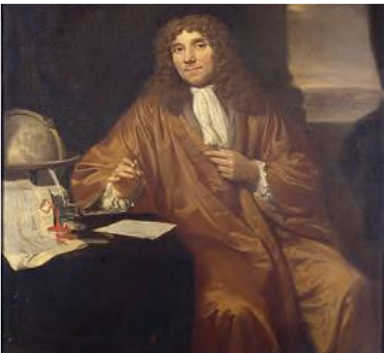
Scientist in the studying room: A picture representing Antony van Leeuwenhoek, the first person to examine pool water under a microscope.