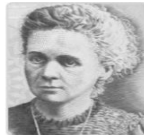
Görsel 4.12: Marie Curie (Temsili resmi)