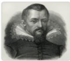
Görsel 1.24: Johannes Kepler (Temsili resmi)

When Table 2 is examined, it is seen that the gender distribution of scientists in the textbooks is concentrated on male scientists in the 12th grade according to the class level. It is understood that the distribution of male scientists according to the field and type of publishing house in the level of 12th grade is physics and private publishing house (35.3%). However, it is seen that the image of male scientist stands out again in the 9th grade's field of chemistry in the types of private publishing house (24.1%) and MEB Publishing House (science high school) (30.4%). On the other hand, it is seen that female scientists are represented at low rates in the 12th grade's field of biology prepared by MEB Publishing House (5%) and MEB Publishing House (Science High School) (5%) and in the 11th and 12th grade's field of physics prepared by all the publishing houses (0.6%). This result of the research reveals the scarcity of female scientists according to gender distribution of scientists in secondary school textbooks. At the same time, it is determined that the gender distribution of scientists does not show a systematic and uniform distribution at all class levels. Sample citations are shown in terms of the gender of scientists in Figure 1.