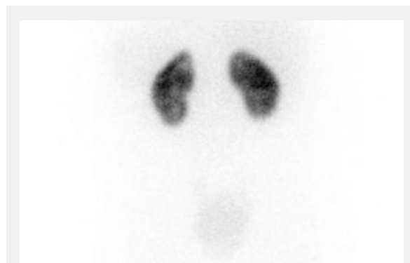
Fig. 5. Posterior view. Left renal scars alone.

Fig. 4. shows right renal function is 9% in a three month-old baby in his/her first DMSA scan. This hypoplasia may have occurred in the prenatal period because of high intravesical pressure with severe VUR. Left kidney may be preserved by 'pop-off' mechanism. Figs. 5 and 6 show that renal scarring has increased within the three years following valve ablation with recurrent UTI's.