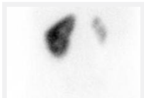
Fig. 4. Posterior view. Right renal hypoplasia.

Fig. 4. shows right renal function is 9% in a three month-old baby in his/her first DMSA scan. This hypoplasia may have occurred in the prenatal period because of high intravesical pressure with severe VUR. Left kidney may be preserved by 'pop-off' mechanism. Figs. 5 and 6 show that renal scarring has increased within the three years following valve ablation with recurrent UTI's.