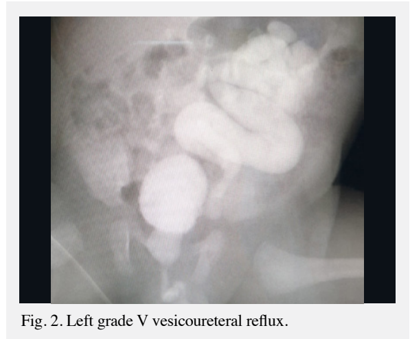
Fig. 2. Left grade V vesicoureteral reflux.

(trabeculation), loss of normal shape of bladder etc. Twenty one had posterior urethral dilatation namely key hole sign on US (Fig. 3).