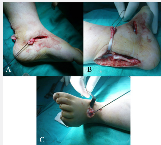
Fig. 2. A,B,C Transfer of the tibialis posterior tendon to the lateral cuneiform.