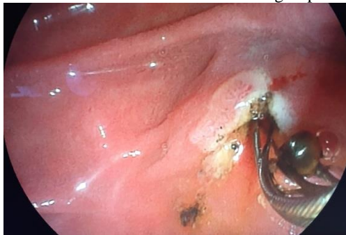
Figure 2. Choledochal stone was removed after endoscopic sphincterotomy

Difficult ERCP was due to the difficulty of selective cannulation of choledochus. Precut sphincterotomy was performed in these patients and the procedure was performed successfully in the second ERCP (Figure 2). The mean length of hospital stay in group A and group B patients was 5.29 \pm 3.38 and 6.29 \pm 5.39 , respectively, and the average cost was 474 \$ \pm 286 \$ and 564 \$ \pm 664 \$ , respectively, with no statistical difference between the groups.