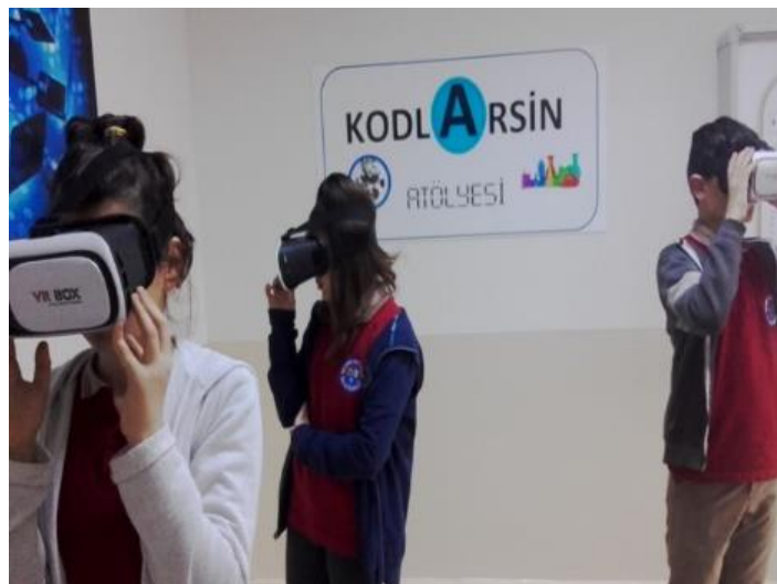
Figure 4. Sample photo of students using technology in the classroom

Next, the benefits of technology use were asked to the teachers. It was concluded that using technology support students’ learning, improve students’ technology literacy, individualize learning, support student-centered practice, makes difficult concepts easier to understand for students, individualize learning, makes possible to establish multiple learning settings at the same time, and makes possible to see different perspectives (Table 4).