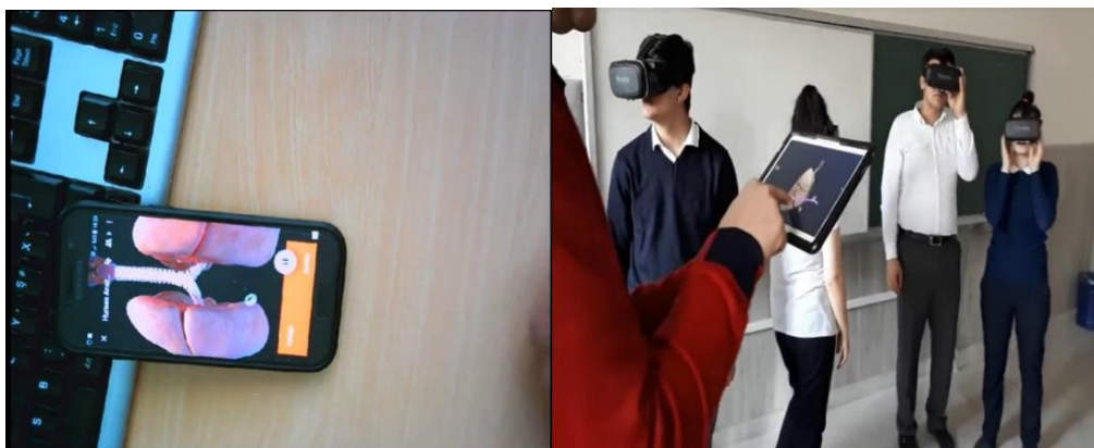
Figure 6. Use of Virtual Reality Cardboard in Education

Lastly, the question about “How does the use of VR affect your opinion about technology integration in the classroom? Why?” was asked to the teachers (Table 7). Teachers mentioned that the use of VR in the classroom enhanced their intention to use technology for education (Figure 6). During teacher training, teachers developed specific skills such as the ways of determining students’ needs, identifying the most recent technology, and combined these skills into practice. The exemplary answers were provided below: