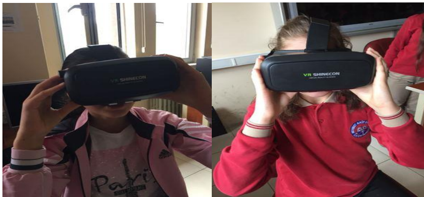
Figure 2. Virtual reality cardboard display