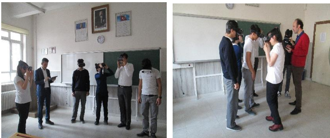
Figure 3. The sample photos from different classes

The result of the analyses indicated that teachers provided answers related to their ITP in the classroom. All participants confirmed their use of technology to some extent in the classroom. More than half of teachers stated that they always used technology in their classes (Figure 3). Teacher five mentioned that she used technology practices to give children a comfortable learning environment.