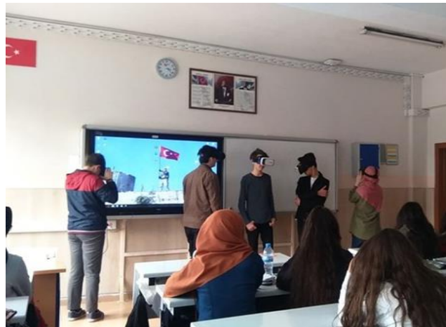
Figure 5. The Use of Virtual Reality Cardboard in the Classroom

The analyses indicated that teachers used VR for different purposes (Table 5). Teachers believed that with the help of VR, learning would be exciting and fun. Teachers recognized that the use of VR increased students' attention and motivation in the classroom (Figure 5). They also used VR to travel distant locations such as the interior of the volcano. Furthermore, teachers highlighted that VR allowed teachers to act as a facilitator in the classroom. They devoted more time to learning students' learning styles, and based on their observations, they planned adjustments in the classroom.