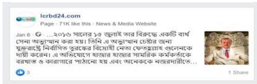
Figure 3: “lcrbd24” Shared Detail about Failed Coup

In another page named “lcrbd24” also given a detail of failed coup and started from the childhood of president Recep Tayeep Erdogan, his political participation, formation of AK party, causes of 15 July failed coup and its aftermath. This post also grasps massive comments and quarries where people whose language is Bengali; from different part of the country was asking present situation and aftermath. It express peoples interest and positive attitude for Turkey.