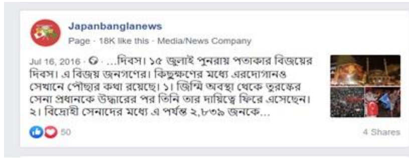
Figure 2: “Japanbanglanews” Sheared Coup Timeline Step by Step