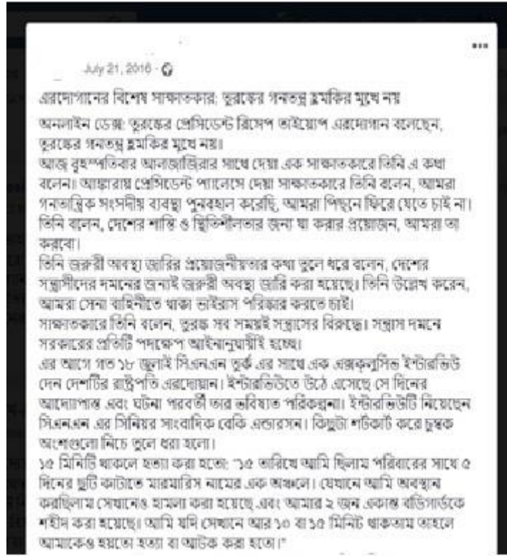
Figure 4: Bangladeshi Facebook Activist Translated Erdogan’s Interview