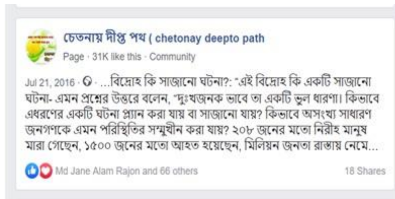
Figure 5: “Chetonay Deepto Path” Strongly Denied Western Media’s Blame Against Erdogan

In another facebook page, named “Chetonay Deepto Path” introduced an important issue in Bengali language. Some western media blamed that 15 July coup was pre planned coup and this page strongly denied that allegation and strongly analysed the speech of president Erdogan that how he explained this coup where hundreds of peoples were affected, 208 peoples were dead and many were injured even president himself being affected. So this event never be pre-planned as the western media stated. This post defends the allegation and showed the logics against the allegation. This post sheared 18 times and viewed 31 thousand times. So this also illustrated that in Bangladeshi facebook or other social media was active at the same time with main stream news media.