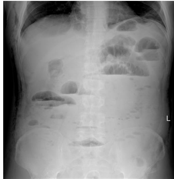
Figure 2: Dilatation of small bowel loops with air-liquid levels.