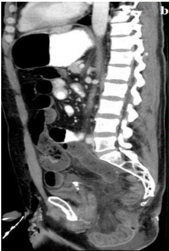
Figure 1a-b: Axial and coronal images of contrast-enhanced CT of abdomen shows herniation of the small bowel loops through a defect in the posterior pelvic floor into the perineum with thickening and increased enhancement of the hernia wall.