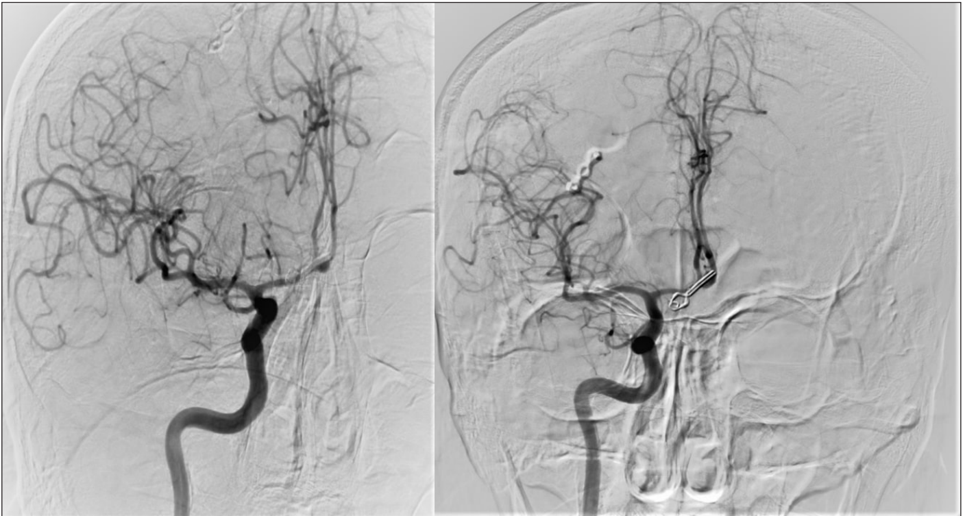
Figure 3. A not-clearly-discernible vasospasm in a patient that was operated for anterior communicating artery aneurysm. The patient enjoyed a significant clinical improvement after treatment, but there was not a significant radiological improvement.