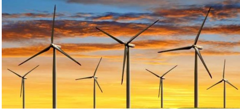
Figure 3. Wind Power Plant (RES)

Table 2 shows the wind power plants and installed forces in Mersin.