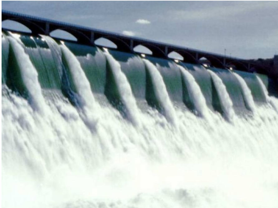
Figure 2. Hydroelectric Power Plant (HEPP)