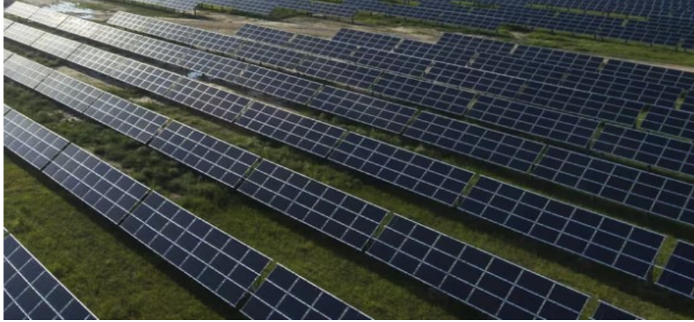
Figure 4. Solar Power Plant (SPP)

Table 3 shows the solar power plants and installed power in Mersin. There are only six solar power plants in Mersin Province. There are 7 personal small powerful solar power plants to produce the electrical energy used in its own enterprise. It is understood that the Dayıcık Solar Power Plant has the highest installed capacity in Mersin. It is obvious that the number of installed power and number of power plants is not sufficient due to the fact that Mersin Province is a region receiving intense solar radiation.