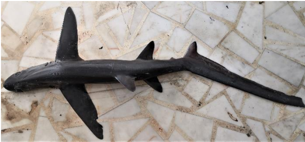
Figure 2. Young female specimen of A. superciliosus from Taşucu coast (NE Mediterranean, Turkey)