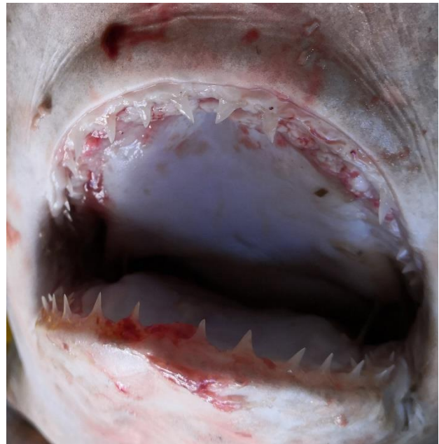
Figure 3. Jaw image of the captured sample.

Morphometric measurement of two selected studies from the Mediterranean Sea was compared with this study in Table 2. When total length values investigated in detail, the Mersin sample and Dodecanese (Corsini-Foka & Sioulas, 2009) samples look similar. According to Compagno (2001), only the sample from Mersin is a juvenile individual.