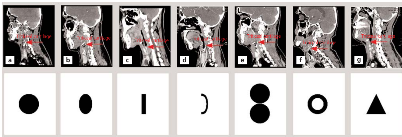
Figure 1. Determination of the shape of triticeal cartilages on sagittal CT images. (a) circle; (b) oval; (c) rod; (d) hook; (e) double circle; (f) ring; (g) triangle shaped triticeal cartilages.