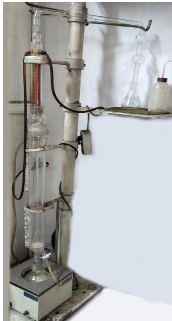
Figure 2. Perforator test device

The perforator test device in which formaldehyde emission tests are performed is given in fig.2.