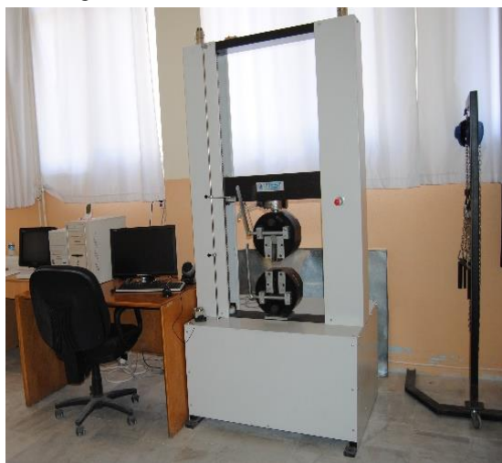
Figure 1. Universal test device

The universal test device for mechanical experiments is given in fig.1.