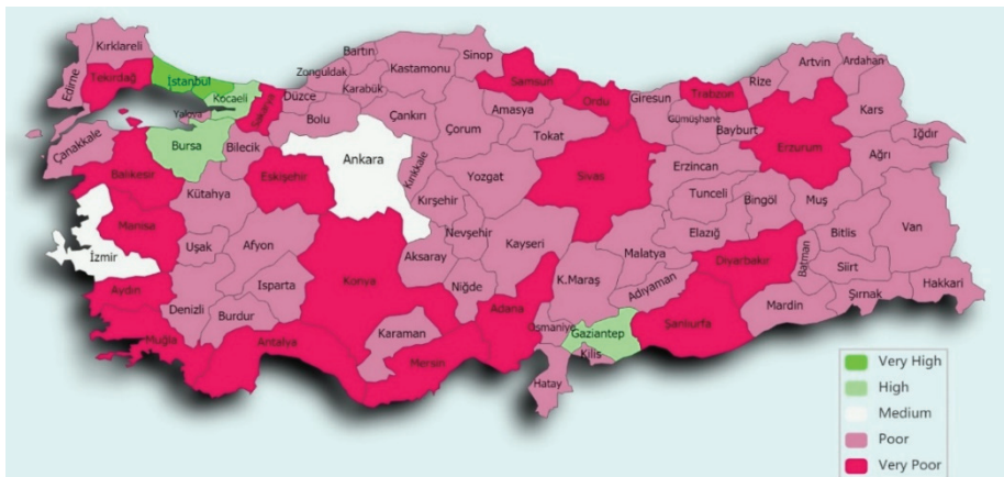
Figure 3 - Municipal water distribution model results for 2016 according to Hierarchical Gray Relational Clustering