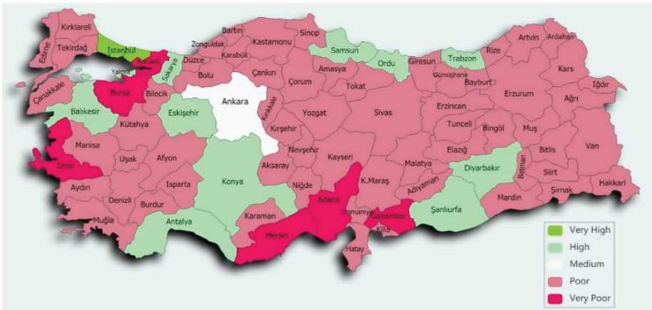
Figure 2 - Municipal water distribution model results for 2006 according to Hierarchical Gray Relational Clustering

Figure 4 shows how the management of the distributed water changed over 10 years. This figure illustrates the general structure of the long-term change result of the HGRC spatial distribution maps depicted earlier in Figures 2 and 3. It demonstrates that Izmir, Bursa, Kocaeli, and Gaziantep Provinces displayed positive developments in distributed water management over the decade. The Aegean region, on the other hand, is the region where water management generally worsened. It was also determined that in the Central Anatolia region, Eskişehir and Konya managed to distribute water poorly. Figure 4 shows that in the Eastern Anatolian region, water distribution in Erzurum, Şanlıurfa, and Diyarbakır has deteriorated. On the other hand, the provinces colored white showed no change in distributed water management level between 2006 and 2016.