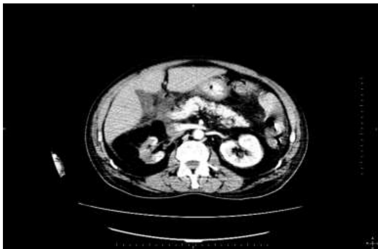
Figure 2. The right kidney was small sized while the left kidney dimensions were normal. Main renal artery and its branches sized smaller compared to left ones. CT demonstrated hypodense, non-enhanced corticomedullary areas in the middle one-third of right kidney. Some of the affected zone were seen as wide-wedge shaped, clearly demarcated areas while other areas were seen as ill defined, focal, peripherally located hypodensities.