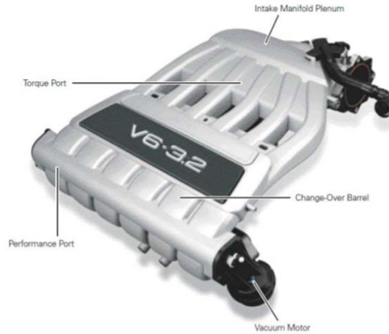
Figure 3. Variable way intake manifold [8]

torque change overall. The fill volume has a huge impact on engine performance and pollutant emissions. Using variable fill volume manifolds can increase the performance of the engine. Using variable intake manifold reduces torque drops at higher speeds, and torque distribution at lower speeds is better [9].