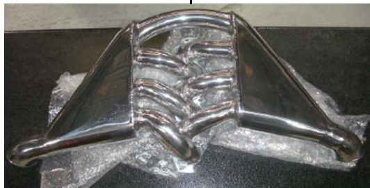
Figure 4. Dual zone intake manifold [9,11]

Such manifolds have two filling volumes. This feature increases power at low rpm and increases gas response compared to other manifolds. Dual-zone manifolds are used especially in large-volume engines [9,11].