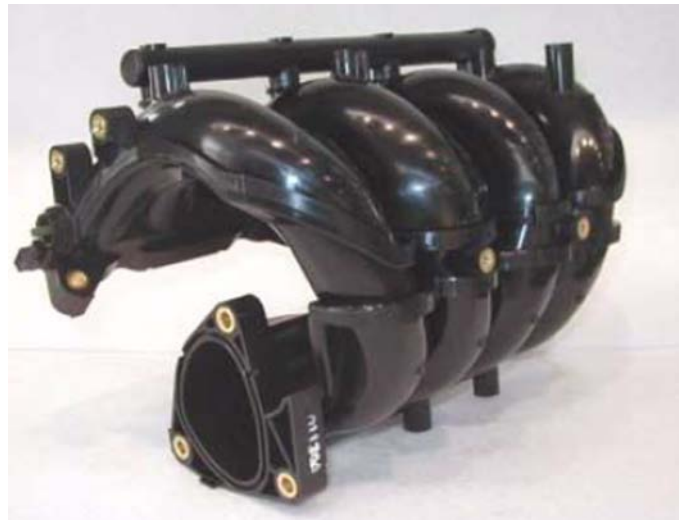
Figure 1. Intake manifold view [4]