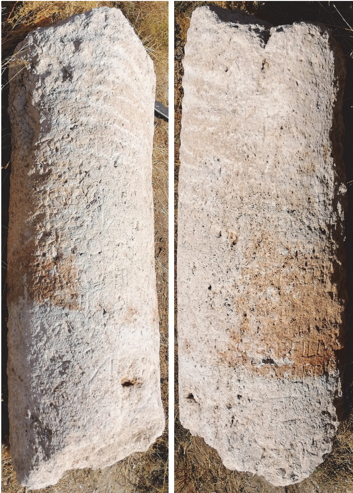
a) Left half