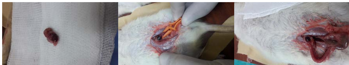
Figure 1: a. Macroscopically all ischemic ovaries were dark coloured and hemorrhagic. b. Ischemic area indicators in the ischemic control (saline) group. c. Group 1 after reperfusion.

Kruskal Wallis H test; a: 0.05; Post-hoc: Dunn-Sidak Test; a: The difference between the control group is statistically significant; b: The difference between group 2 is statistically significant; c: The difference between group 3 is statistically significant; d: The difference between group 4 is statistically significant; e: The difference between group 5 is statistically significant. PMNL: Polymorphonuclear neutrophil leukocytes