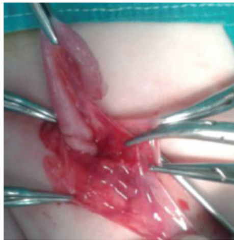
Figure 3: Appendix meso is attached to the wall of hernia sac, appendix is normal-looking (however, the pathology revealed acute appendicitis)

The postoperative course was uneventful. Patients undergoing only hernia repair due to normal appendix were discharged on the same day. Patients who underwent appendectomy were discharged on the 3rd postoperative day. Postoperative wound infection did not develop in any of patients.