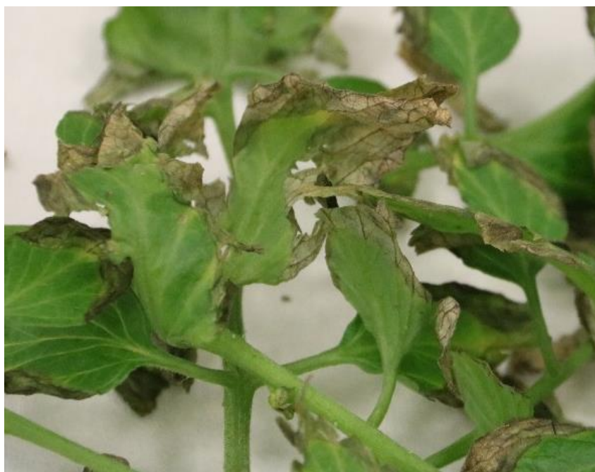
Figure 4. Tuta absoluta damage on tomato leaf axil

types have been expressed in previous study (Bayrambekov, 2019). At first glance, yellow spots on the leaves infected with the pest was appeared. But on closer inspection, it was understandable that it was dried epithelium after the parenchyma of the leaf axil eaten by the larva of the pest. As the number of larvae increases, so does the dried area of the leaf axil, which consists only of epithelium (Figure 2; 4).