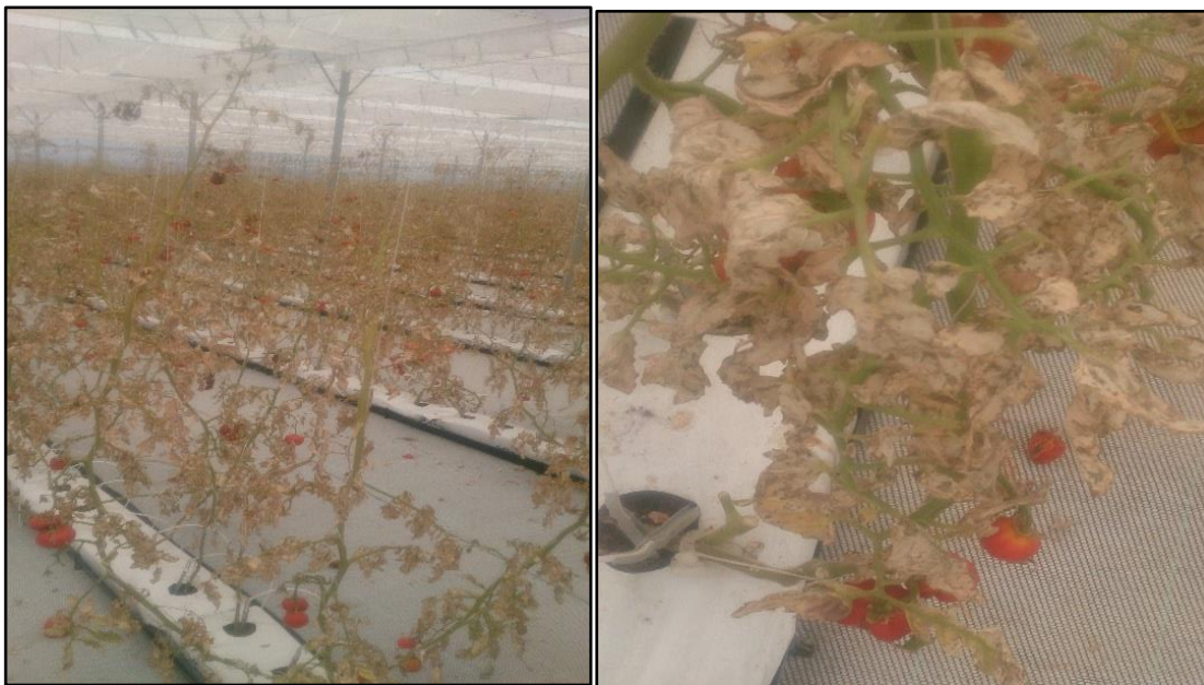
Figure 2. Tuta absoluta damage in the tomato greenhouse in case of high population

On the other hand, adults were active at night and hide in dense vegetation during the day. As a matter of fact, it was possible to see moths flying in the daytime if the plants were touched. In case of high population, the mass flight of adults during the day can be observed as well.