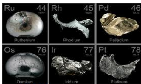
Fig. 3 Platinum Group Metals (PGMs)

Asteroid mining has been proposed as an approach to complement Earth-based supplies of rare earth metals and supplying resources in space, such as water. However, existing studies on the economic viability of asteroid mining have remained rather simplistic and do not provide much guidance on which technological improvements would be needed for increasing its economic viability. Both, in-space resource provision such as water and return of platinum to Earth are considered (Hein et al., 2018).