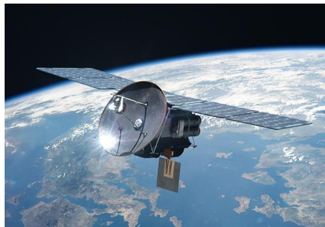
Fig. 1 Arkyd-3 satellite

( https://www.planetaryresources.com/missions/arkyd-301/ ).