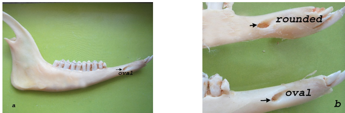
Figure 1: a. Oval shaped mental foramen, b. Round shaped mental foramen.

Mental foramen is usually located on the lateral face of the mandible. The shape of mental foramen of Hemshin sheep was only oval and round. There was no difference in shape between the bilateral faces of the same mandible. The mental foramen was quite deep. The mandibles that were examined are in the following picture (Figure 1/a, b).