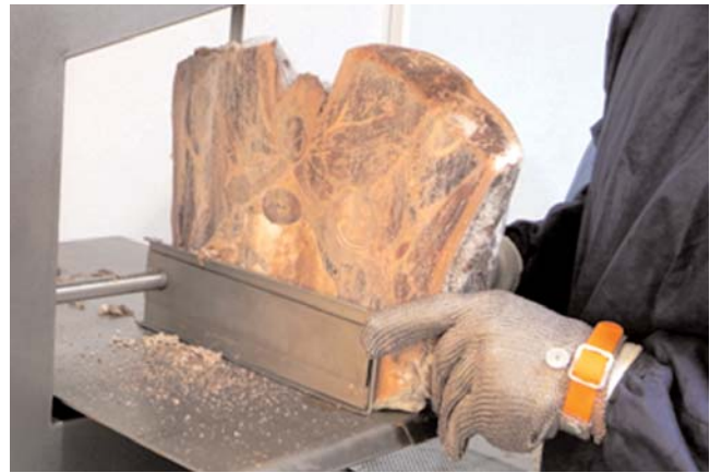
Figure 1. Sectioning stage (coronal).

In impregnation step we followed up two different protocols: First, we used xylene added (S/X ratio: 1/0.6) silicone reaction mixture (S10+S3, Biodur Products GmbH, Heidelberg, Germany) as described by Steinke et al.; [20] second, the impregnation was performed intermittently at room temperature as described by Tianzhong et al. [21] Curing of impregnated slices carried out in a gas-curing chamber in which the specimens exposed to silicone hardener (S6 Biodur Products GmbH, Heidelberg, Germany) vapor again at room temperature. The added xylene removed out from the slices using vacuum chamber (Kena-Tek Inc., Izmir, Turkey) after the curing process. [22]