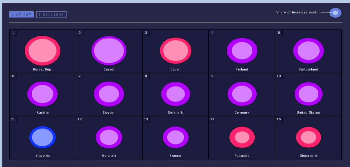
Figure 3: Ratio of R&D Expenditure to GDP Top 15 countries.

expenditures are given as the ratio of GDP. Turkey's annual R & D expenditure as purchasing power parity was $ 15,933 million. The percentage of GDP of R&D expenditures was 0.9%. The number of researchers per million people was 1160. The ratio of male researchers was 63% and female researchers 37%.