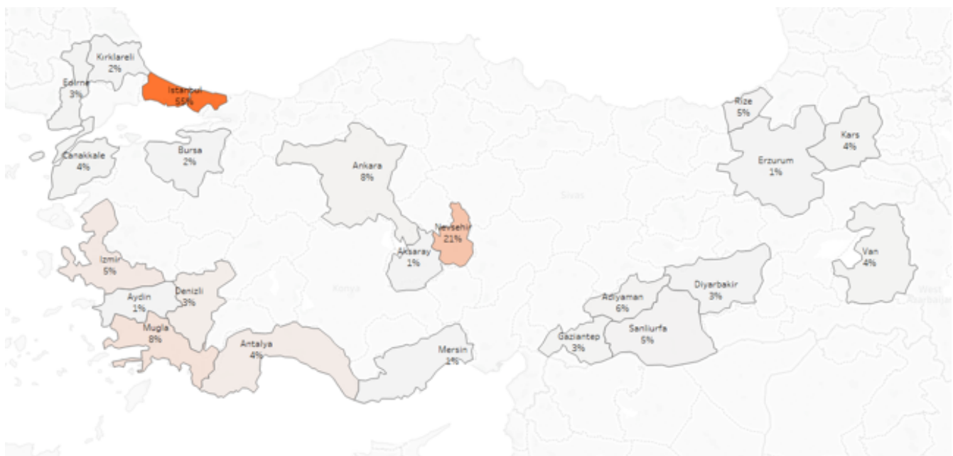
Figure 2. Most shared photos by cities

Perhaps the most prominent image of the Cappadocia region seems to be balloon travel. All bloggers visiting this area shared images of balloon travel (107) as well as photos of the Fairy Chimneys (95). Mugla and Izmir were generally popular with their rural areas or their districts rather than centres.