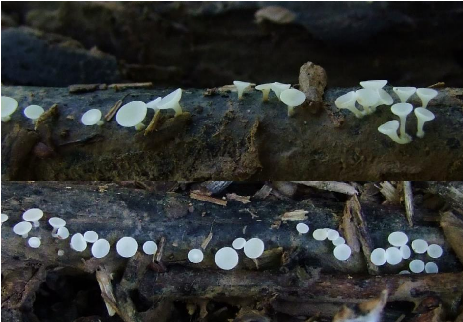
Figure 1. Ascocarps of Hymenoscyphus caudatus

filiform, equal or slightly exceeding the asci, some branched at the base, septate (Fig. 2a). Ascospores 15-24 × 4-5.5 µm, ellipsoid, subfusoid to ovoid, hyaline, smooth, aseptate or rarely 1-septate, generally with two large, irregular guttules and several smaller guttules (Fig. 2b).