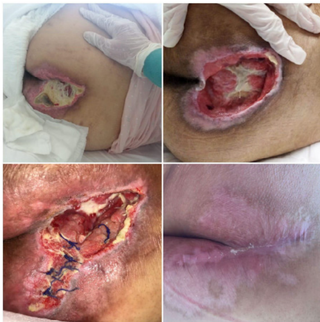
Figure 1. Pressure Ulcer Repair with Skin Advancement Flap