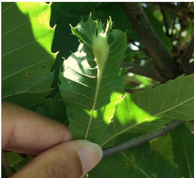
Figure 2. Dryocosmus kuriphilus leaf-gall on a chestnut tree in a private orchard in Ödemiş, İzmir