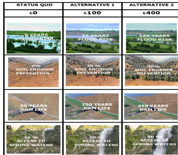
Figure 2. Example of a choice card (Deniz, 2012)