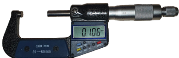
Figure 1. Digital Contact-Type Micrometer

The initial evaluation of thickness ( t_0 ) for each sample was performed for 3 times by a single operator for each sample using an industrial type screw-type digital micrometer (0.001 mm) with 25-50 mm measuring range (ME-DI-MIC-25-50-LD Digital External Micrometer 25-50mm, Machine DRO, The Allendale Group Ltd., Hoddesdon, UK; Figure 1). This device was used as the control method for monitoring the quantitative dental hard tissue loss, previously (16, 17).