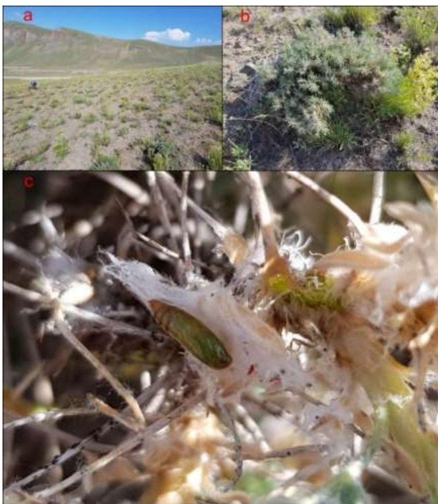
Figure 1. a) Study locality (Nemrut Caldera), b) Astragalus sp. (Leguminosae (Host-plant)), c) Pupa of A. subericinella .

During the field studies conducted by the authors to determine the biology of Lepidoptera species in the Nemrut Caldera on 7 July 2018, a pupa was found on Astragalus sp. (Leguminosae) (Figure 1). The pupa was placed and preserved in a transparent plastic box and examined in Bitlis Eren University, Faculty of Arts and Sciences, Zoology Research Laboratory. A female adult emerged from the pupa on July 13, 2018 (Figure 2a). After the specimen was pinned and labelled, it was softened and stretched into standard museum material. In addition, 2 males and 1 female samples, which are in the collection of Bitlis Eren University, Faculty of Arts and Sciences, Zoology Research Laboratory and collected on 07.07.2015 from Bitlis Eren University Campus, which is very close to the Nemrut Caldera, were also evaluated (Figure 2b). The genital preparations used in the study were prepared according to Robinson [12] (Figure 3).