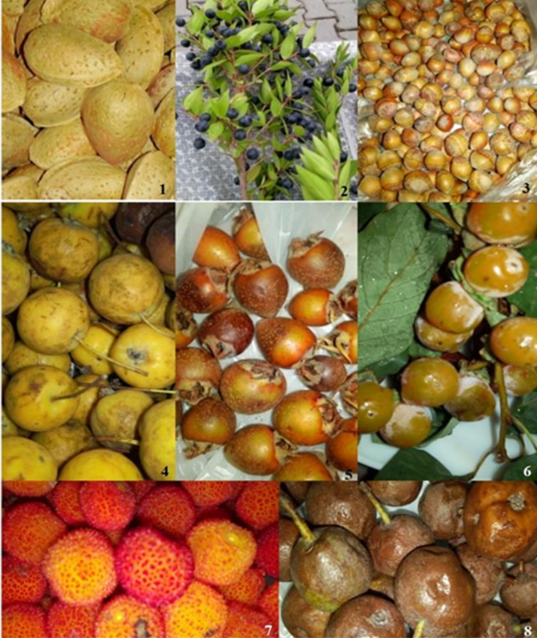
Figure 2. Some wild fruits sold in bazaars in the Edremit Gulf 1) Amygdalus communis (Badem), 2) Myrtus communis (Yaban mersini), 3) Corylus avellana (Yabani findık), 4) Cornus domestica (Üvez), 5) Mespilus germanica (Muşmula), 6) Diospyros lotus (Hırnık), 7) Arbutus unedo (Dağ çileği), 8) Pyrus elaeagnifolia subsp. elaeagnifolia (Ahlat)