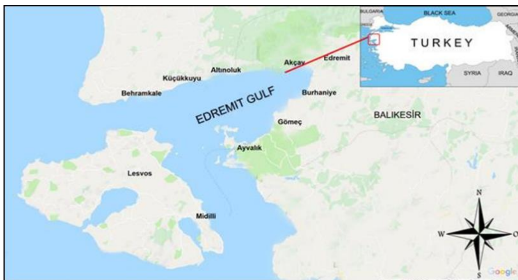
Figure 1. Geographical location of the study area (Edremit Gulf)

The Edremit Gulf which located in between Mount Ida and Madra mountains the west of Balıkesir (Turkey) province and coastline of Aegean Sea had been among the most important olive producer centers of Anatolia date from ancient ages. The study area is included in the Mediterranean and European – Siberian phytogeographic regions within the B1 grid square according to the Grid classification system used in the Flora of Turkey [12]. Edremit Gulf is located between 39° 16' - 39° 36' north latitudes and 26° 04' - 27° 06' east longitudes and it is surrounded by Edremit, Havran, Gömeç and Ayvalık districts respectively. The region has a rich flora on account of its climatic properties, geological structure and location [1,7]. Geographical location of the study area is presented in Figure 1.