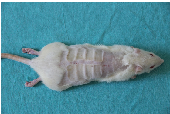
Figure 2. The “comb burn” model was applied to the dorsum of the rat to perform the burn injury