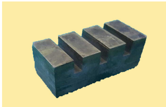
Figure 1. The probe that was used in the experiment

As established by Regas and Ehrlich [17] in their previous study the thermal wound formatted by brass comb. The brass comb has four prongs (0.5 cm x 2cm) separated by three 5-mm notches to create four distinctive burn areas divided by three interspaces (1 cm x 2 cm) of unburned skin. The interspaces represent the zones of stasis, and the burned areas represent the coagulation zones (Figures 1 and 2). Ringer Lactate 10 ml/kg intraperitoneally was used for liquid resuscitation following the thermal injury. No treatment was administered in group I (control group). Group II underwent NAC therapy intraperitoneal (100 mg/kg/day) 10 days long, whereas group III underwent Ozon therapy intraperitoneal (10 µg/mL/day) for the same period. A general anesthetic, thiopental sodium, 50 mg/kg was used for scarificatio of rats on the 10 th day.