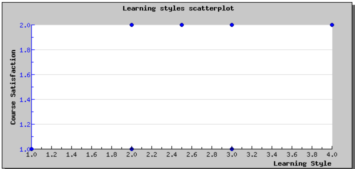
Figure: 2 Learning styles scatterplot (2012). This figure illustrates the scatterplot of the learning styles and course satisfaction data.

The data collected were represented in Figure 2 as a scatterplot of learning styles and satisfaction of course format. As shown by Figure 2, there appeared to be no correlation between learning styles and satisfaction of course format in this current study which was confirmed by the following statistical analysis.