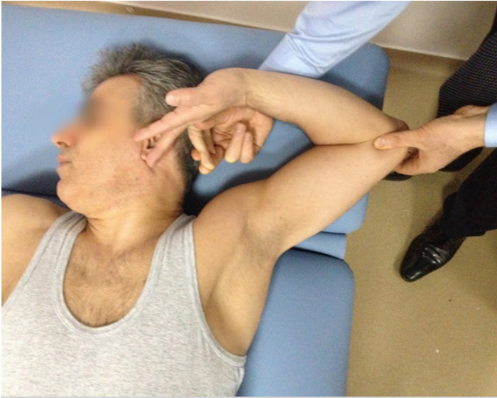
Figure 2. The extremity position for mobilization of ulnar nerve.

The second position for the ulnar nerve was with the shoulder at 90° of abduction, the elbow at full flexion, the forearm in full pronation, wrist at full extension and all the metacarpophalangeal, proximal interphalangeal and distal interphalangeal joints all at full extension (Figure 2).