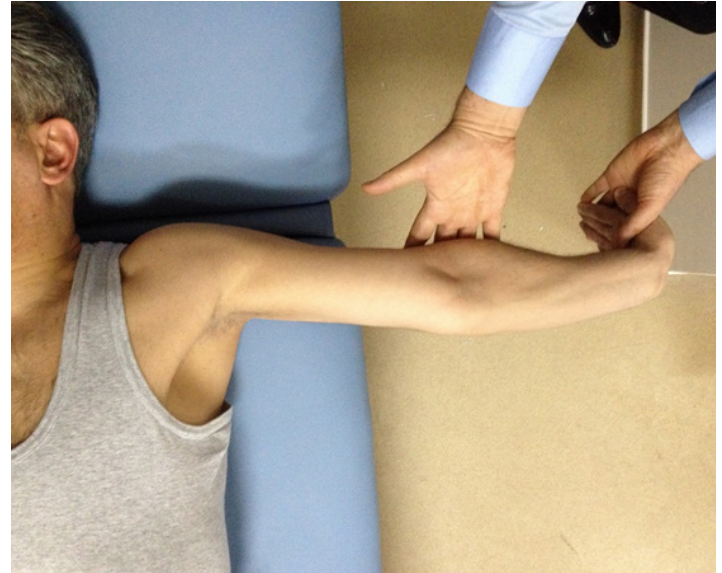
Figure 4. The extremity position for mobilization of median nerve.

A Kirschner wire was placed in the humerus 5 cm above the medial epicondyle, a metallic vascular clip was secured