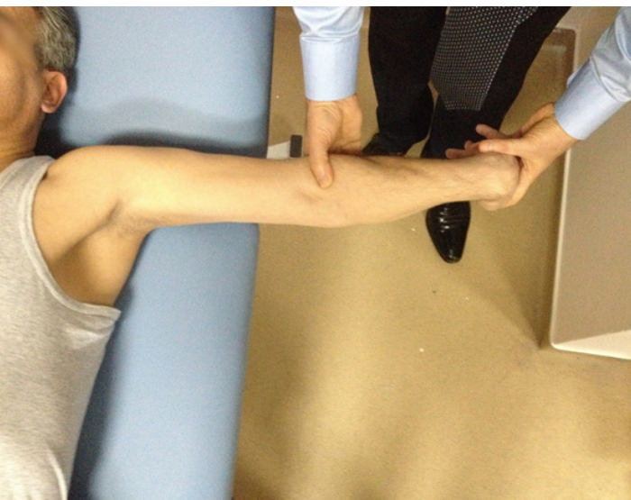
Figure 3. The extremity position for mobilization of radial nerve.

The second position for radial nerve was the neck in lateral flexion position face oriented straightforward the shoulder at 90° of abduction, the elbow at full extension, the forearm at full pronation, wrist and all fingers at full flexion (Figure 3).