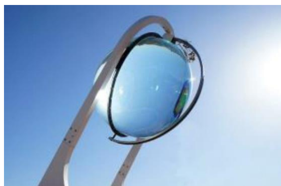
Figure 2. Spherical Lens Systems [6]

The modular collector system, developed by German architect Andre Broessel for his company Rawlemon, it recharges and stores energy during the daytime and can even collect energy from moonlight and ambient light at night. Rawlemon website states, "Using a high efficiency multi-junction cell, the cell surface was reduced to 1% in optimum conditions compared to the same power output as a silicon cell. The system produces twice the efficiency of a normal panel Also, a smaller cell area has a lower carbon footprint as its production requires less valuable semiconductor or other building materials. "Multi-junction cells made of multiple materials react to multiple wavelengths of light and some of the energy to be lost can be captured and transformed. Multi-junction cells can only work with concentrator systems [6] Spherical lens systems are shown in Figure 2.