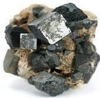
Figure 4. Light Harvesting Film of Crystallizing and Natural Structure [10]

Researchers believe perovskites pave the way for high-efficiency, low-cost solar cells. Perovskites are easily synthesized and absorb light in the blue region of the spectrum, contain silicon that can absorb long wavelength red and near infrared light. Scientists found that a new tandem solar cell containing monolithic perovskite and silicon produced electricity with an efficiency of 18 percent. Although this is not the maximum solar cell efficiency rate, they believe it may be sufficient for industry studies. Many parts of the world have established production facilities for silicon cells. Perovskite layers can significantly increase the productivity level. To achieve this, production techniques need to be supported by only a few production steps FG [10]. The crystal and natural structure of Light Harvesting Film is shown in Figure 4.