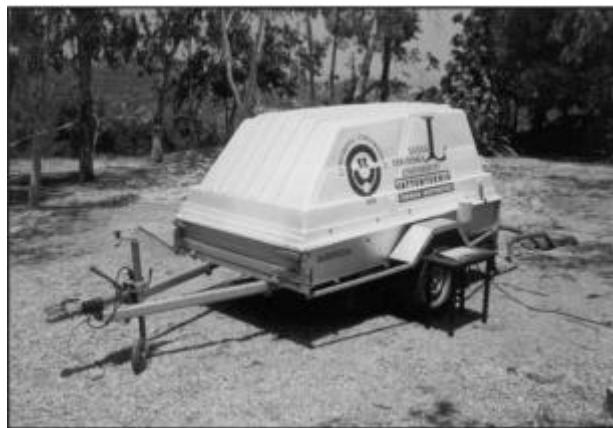
Figure 12. In-situ TRT apparatus [32]

Thermal conductivity; It is found by the proper dimensioning of the ground and an underground covering an energy well. This system is a thermal energy system. Effective in-situ heat to estimate the conductivity of the system; The thermal response of a well is found by measuring the ground. Field tests are done with a mobile thermal response test (TRT) apparatus (Figure 1) [32].