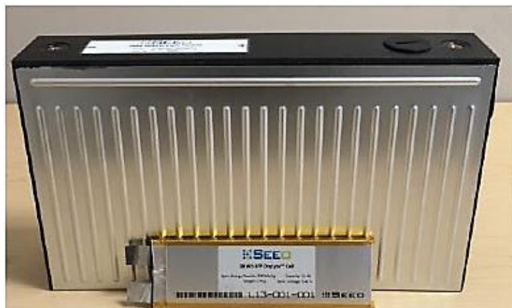
Figure 9. Dry Lithium Battery [23]

Seo, the founder of Silicon Valley, is developing a battery for the electrolyte that uses a solid dry polymer that is less flammable than a liquid one. It uses lithium for the anode and a new material that can store more energy for the cathode in the manufacture of the battery. Seo has been producing these batteries for testing purposes for some time now. Recently, it was seen that German auto parts manufacturer Bosch bought dry lithium production [18]. The dry lithium battery is shown in Figure 9 [23].