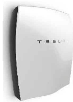
Figure 7. Lithium-Ion Powerwall Battery [16]

Tesla presented its first demo home system batteries in 2015 and 2016. It also offers a 100 kWh battery for utility scale use. Tesla aims to generate 10,000 Powerpacks and 1Gw of electricity. Tesla CEO stated that with 160 million Powerpacks it will enable the entire USA to transition to renewable energy and with 900 million Powerpacks the whole world will make the transition. The lithium ion powerwall battery is shown in Figure 7 [17].