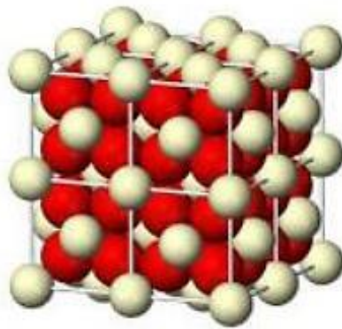
Figure 6. Crystallizing and Atomic Structure for Ceria [12]

Ceria or cerium oxide, which is the most common on earth, tends to exhale and inhale alternately as it warms or cools oxygen. It is considered a tool for generating fuel. A new prototype formulated by the researchers uses a quartz window to pass sunlight through a small gap in a cylinder filled with ceria. When water or carbon dioxide is pumped into the tank, hydrogen and / or carbon monoxide is formed. Hydrogen is used alone in hydrogen cells, and a synthetic fuel (syngas) is produced by mixing hydrogen and carbon monoxide. The resulting fuels are portable and can be used at any time. Researchers believe that improved insulation and smaller openings increase efficiency by up to 19%, making this a viable option [12]. Crystallized and atomic structures are shown in Figure 6.