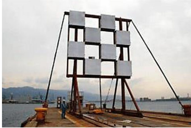
Figure 10. Space Based Solar Power Systems (SBSP) [29]

being connected to wires. Researchers think that this new technology could be an effective energy source in solving both environmental and energy problems in the world. Their goal is to transmit energy from solar panels in orbit by 2030 [28], [29]. Space Based Solar Energy Systems (SBSP) are shown in Figure 10.