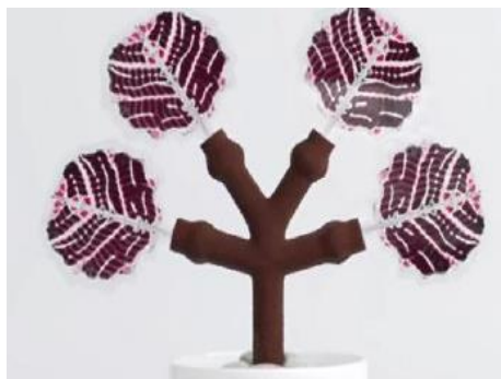
Figure 5. 3D Produce of Energy Harvesting Trees [11]

Researchers at the VTT Technical Research Center in Finland developed some decorative prototypes thanks to advanced solar and 3D printing technologies and called them "energy harvest trees". Thanks to the small leaves, it can provide power to small household appliances and mobile devices by storing solar energy. Small leaves thrive indoors and outdoors, and can collect kinetic energy from the surrounding wind and temperature differences. The leaves of the tree are flexible organic solar cells and each individually has a power converter. The crates are 3D printed and wood-based bio-composites are used as raw materials. They are mass producible [11]. The crystal and natural structure of Light Harvesting Film is shown in Figure 5.