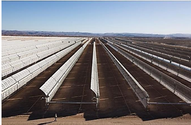
Figure 11. Concentrated Solar Power (CSP) Plant [14]

generating turbines. The heat tank contains melted sand that can store heat energy for three hours. Morocco imports 94% of its energy as fossil fuel from abroad. Concentrated Solar Power (CSP) facility is shown in Figure 11 [14].