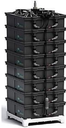
Figure 8. Aqueous Hybrid Ion (AHI) Battery [20]