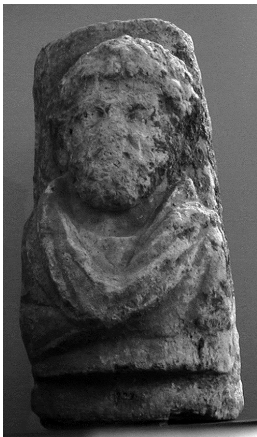
Fig. 4. Inscr. No. 10