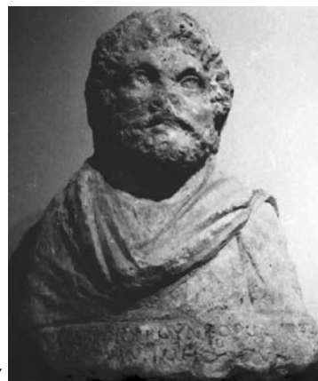
Fig. 6. Inscr. No. 17