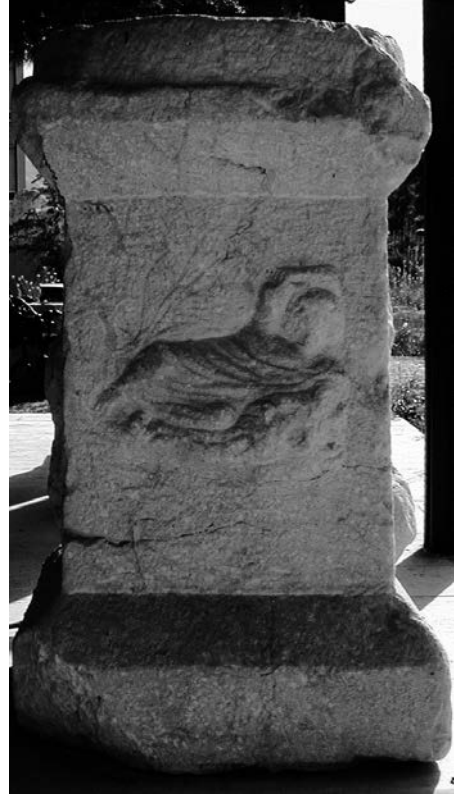
Fig. 1b. Inscr. No. 1