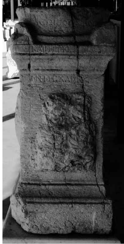
Fig. 2. Inscr. No. 5