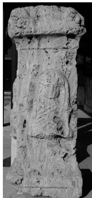
Fig. 3c. Inscr. No. 9