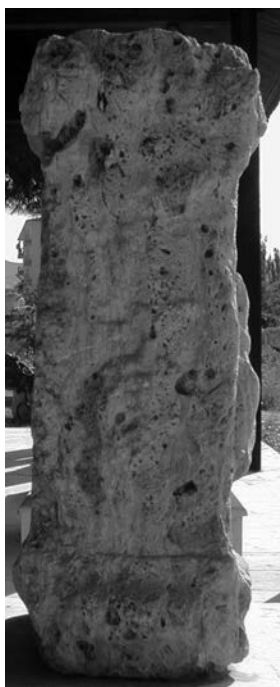
Fig. 3b. Inscr. No. 9