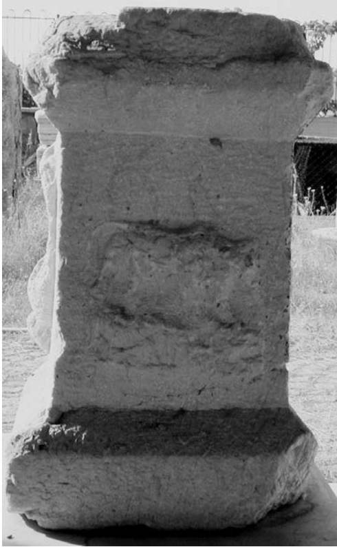
Fig. 1c. Inscr. No. 1