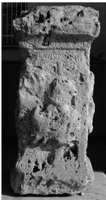
Fig. 3a. Inscr. No. 9