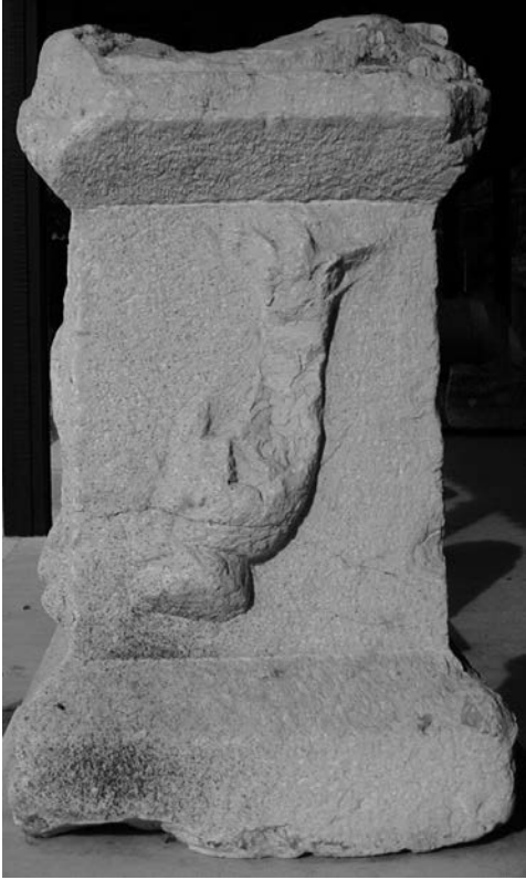
Fig. 1a. Inscr. No. 1