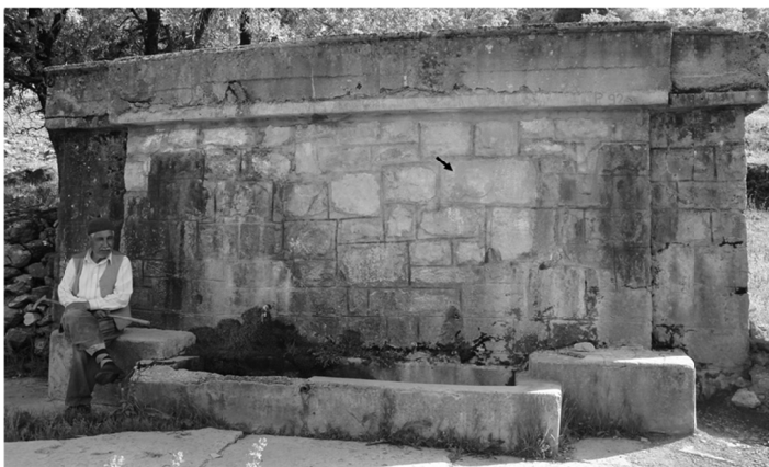
Fig. 2. The Village Fountain