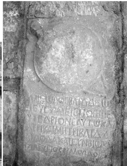
Fig. 3. The Inscribed Stone