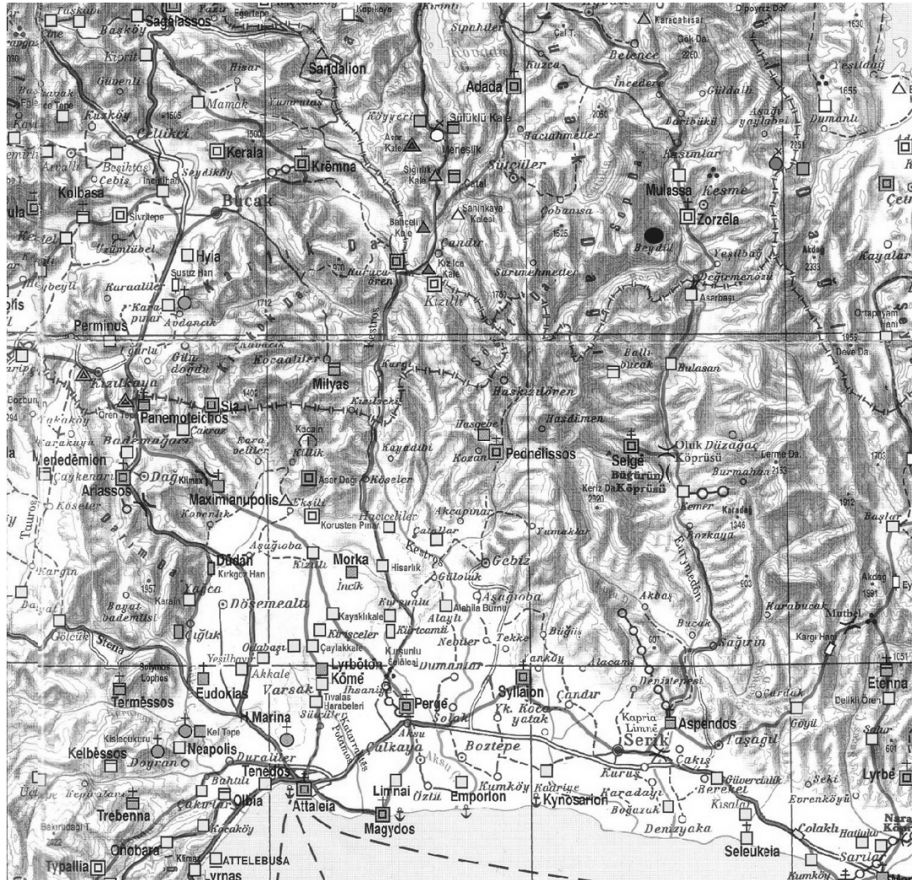
Fig. 1. Bezdili (after the map of Tabula Imperii Byzantini 8)