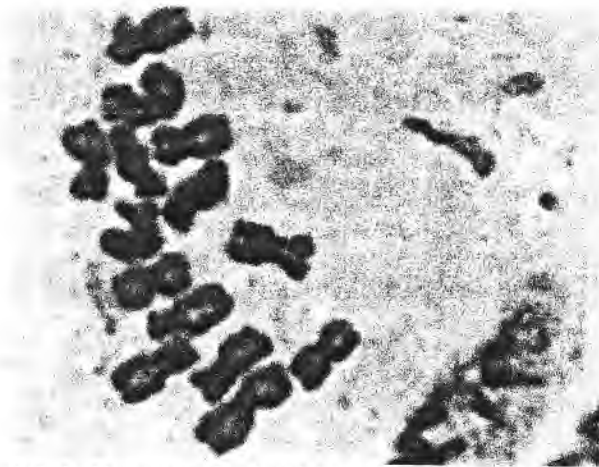
Fig. 1. Chromosomes of root tip cells of Pisum arvense L. (X 2448).