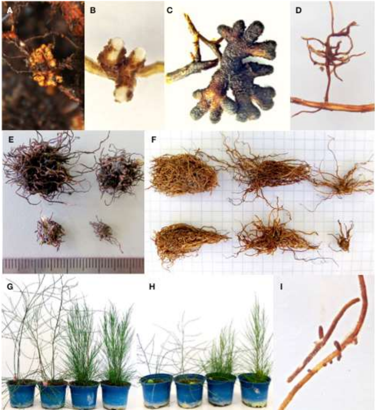
Figure 1. A. Frankia nodule (coralloid) on Alnus glutinosa growing naturally in Rize Province, Turkey; B, C, Frankia nodules, young unlobed and older lobed (coralloid) nodules, on Elaeagnus angustifolia container grown in 25% Niğde soil; D, cluster root in Casuarina cunninghamiana container grown in 25% Niğde soil; E, F, Frankia nodules with prolific development of nodules roots on C. cunninghamiana container grown in 75% Niğde soil for 1 year (Expt 2) and in 25% Adana soil for 7 months (Expt 4); G, H, growth of Allocasuarina verticillata and C. cunninghamiana in 25% Adana soil after 7 months (Expt 4) and 25% Izmir soil after 6 months (Expt 5); and I, mycorrhizal roots in A. verticillata that are short lateral roots that grow perpendicular to the main root often thicker with a terminal lobe (see in plants grown in 25% Niğde, Adana and Izmir soil, Eppts 3, 4 and 5, respectively).

Casuarina cunninghamiana was included in all experiments with nodules, cluster roots and ectomycorrhizal roots developing variously across the experiments. In experiment 1, the plants grew slowly with a moderate proportion of chlorotic