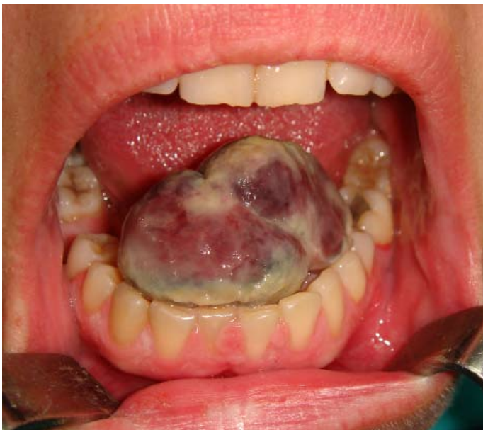
Fig. 2: 17 days after the first examination, a large mass on the lingual side of the mandible included the floor of the mouth