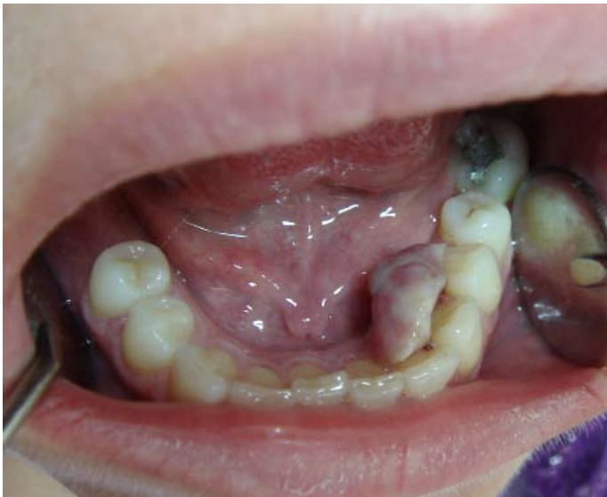
Fig. 1: At initial presentation, a gingival enlargement at the mandibular left side

In most cases, the pregnancy tumor resolves spontaneously after parturition, and therefore asymptomatic lesions should not be excised during pregnancy. If the lesion causes significant functional or esthetic problems, surgical removal should be considered (Daley et al., 1991). However, without removal of the inciting trauma, the lesion may recur (MacLeod and Soames, 1987; Daley et al., 1991). In the present case, the pregnancy tumor was removed surgically during the second visit of the patient.