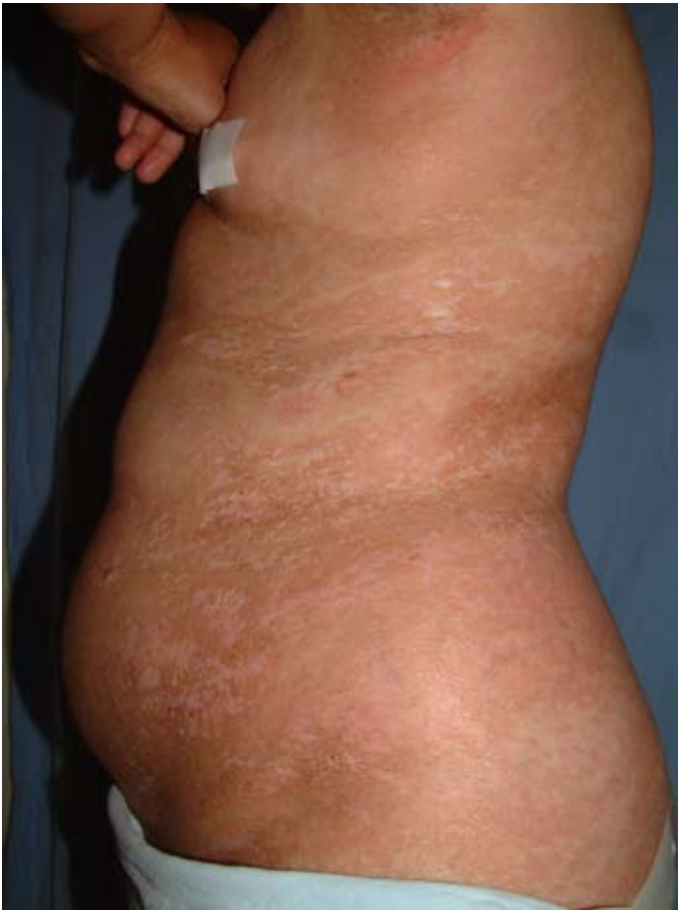
Fig. 2: Atrophic, pigmented linear streaks and poikiloderma on the trunk and extremities along the lines of blaschko and telangiectasias with atrophic depressions

the ones at the normal skin biopsies (Fig. 3). Repeated HIV serologies were positive but confirmation test with Western Blot was negative.