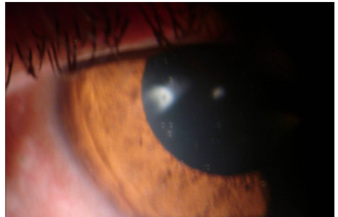
Fig. 2. Paracentral crystallin lens perforation, intralenticular gunpowder particle, multiple black gunpowder particles in the subconjunctival area and in the corneal epithelium of left eye.

Orbital computerized tomography (CT) showed a radiopaque intralenticular foreign body in left eye; otherwise