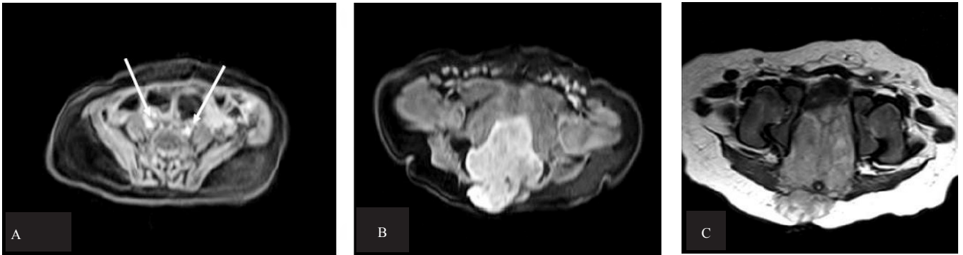
Fig. 1. A: The T1-weighted MR images show that the tumor does not exist at aortic bifurcation level (A) (White long arrows=right and left iliac arteries), starting from lower levels extending down to the coccyx (B) and having heterogeneous signal intensity. C: A 5x6x6 cm soft tissue mass, starting from the presacral compartment at the sacrococcygeal region, surrounding the coccyx, spreading from the pelvic cavity anteriorly and reaching the subcutaneous tissue anteriorly, displacing the urinary bladder and rectum on T2 weighted series.