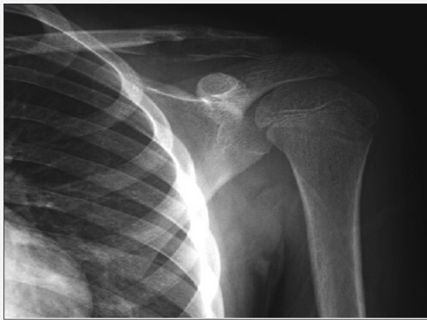
Fig. 1. Lytic lesion causing expansion in the distal clavicle

applied to the patient (Fig. 6). Pathological examination of the curettage material confirmed langerhans cell histiocytosis. The patient is healthy now and he continues to his school with ongoing follow-up.