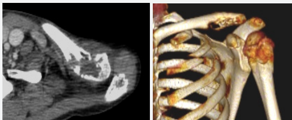
Fig. 2-3. Cortical destruction in the bone seen on axial slice CT and 3-dimensional CT