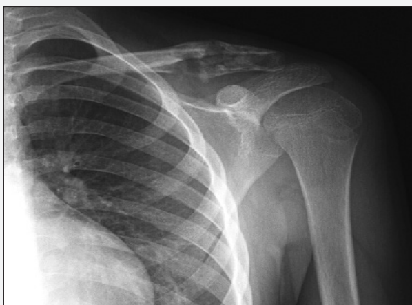
Fig. 6. Recovery can be seen to have started in the lesion area following grafting.