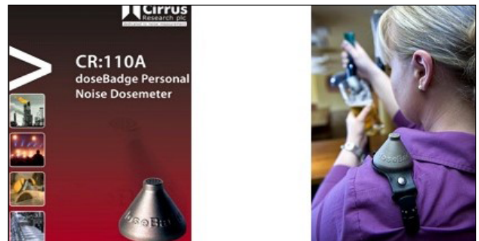
Figure 2. CIRRUS CR-110 A personal dosimeter

Noise measurements were recorded with noise dosimeter in order to measure the noise level of 100 employees working in different positions in open pit lignite mine. For dosimetric measurements, the CIRRUS CR-110 A personal dosimeter was used. Noise dosimeters have been developed to determine the noise that employees are exposed to during normal working days. This is a small, light, and compact piece of equipment that should be worn by the employees. It measures the total A-weighted sound energy received and expresses this as a ratio of the maximum A-weighted energy that can be received per day. This device is very useful when there are significant changes in exposure during the working day. A view showing the catalog and application of the measuring instrument used is given in Figure 2. Noise measurements were made with respect to TS 2607 ISO 1999 (2005).