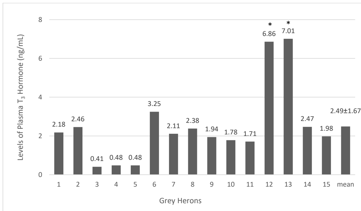
Figure 1. Plasma T 3 hormone levels of rehabilitated healthy Gray herons. *Statistically different individuals. Mean: Fifteen Gray herons' average plasma T 3 level (Mean ± Standart Deviation: 2.49±1.67). p = 0.011 . Chi-square: 27.267.

and T 4 hormones in 6 individuals compared to the others (Figure 1 and 2).