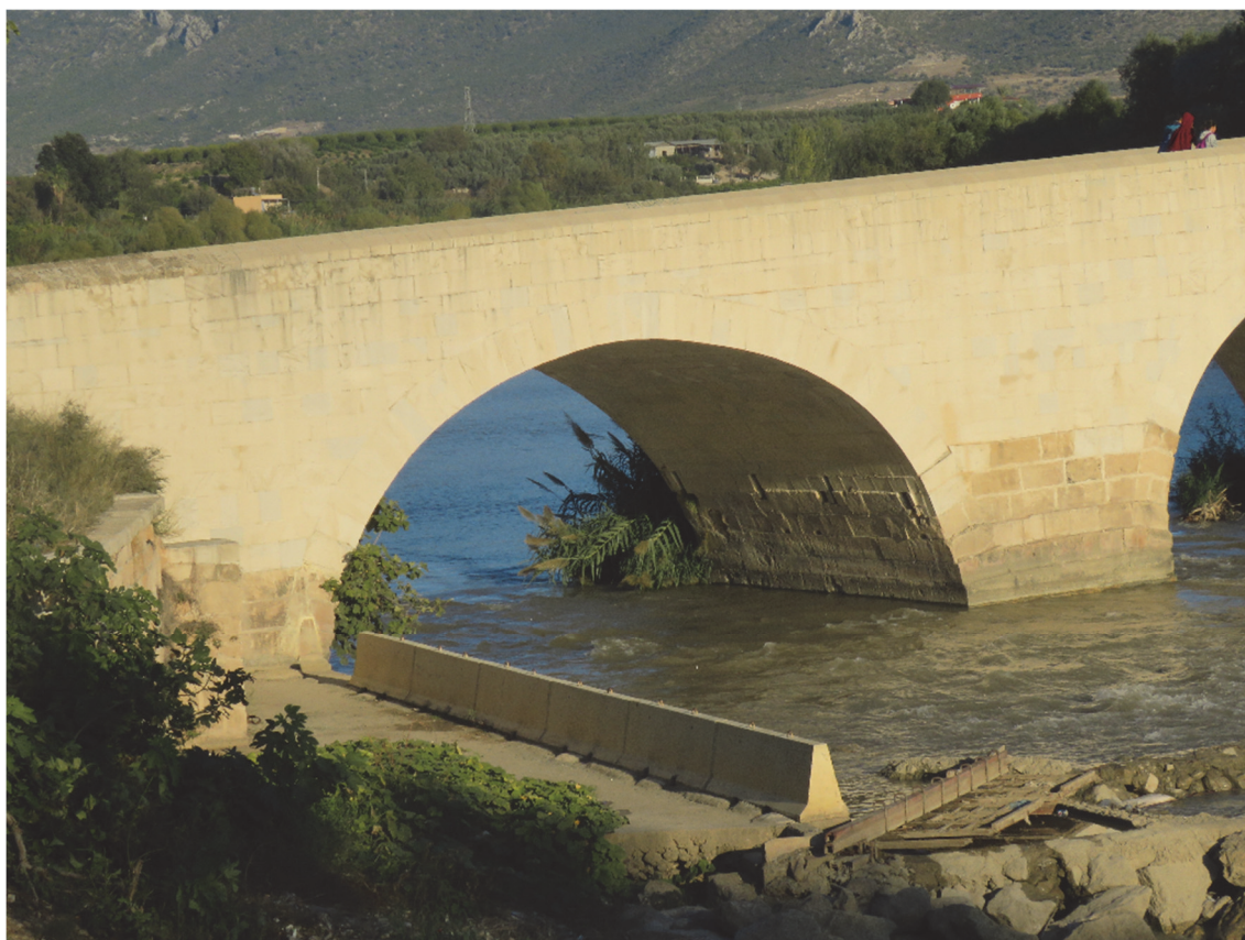
Fig. 3) The First Arch in the Northwest

arch, the other four are shaped as penci arches. Additionally, it is possible to relate the fifth span in the center of the bridge to the Ottoman period, based upon its parabolic arch design. The spans associated with the ancient phase of the structure are the first and the third arches. However, it is understood that these arches also underwent a restoration after the original construction (Fig. 3).