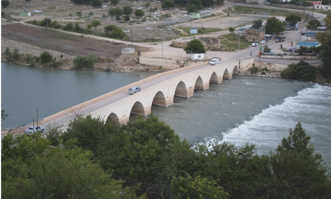
Fig. 1) The Downstream of the Misis Bridge

The Misis bridge, which provides a road connection over Pyramus, extends along the northwest-southeast axis and consists of a total of nine spans. The length of the deck of the bridge is measured as 129.51 m and the width as 6.50 m (Fig. 1). Damaged by the earthquake in 1998, the structure was restored subsequently.