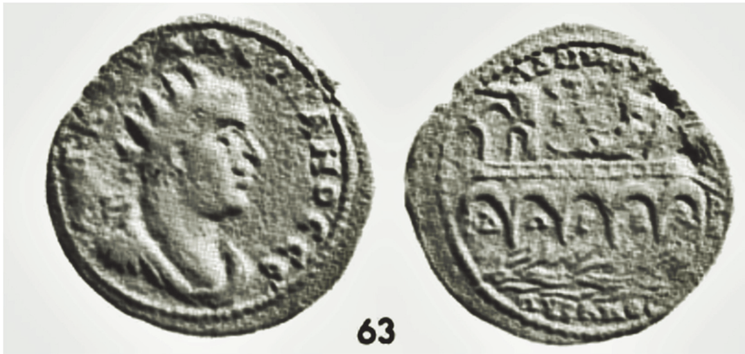
Fig. 4) The Coin of Misis in the Valerian Period (Von Aulock, 1963, Abb. 5)

The first construction of the Misis bridge is associated with the 1st century AD without any evidence in a publication 15 . Some researchers suggest that the bridge was constructed in the middle of the 3 rd century CE during the reign of Emperor Valerian 16 . This suggestion is based on a coin depiction, which is also encountered on the coins of both Misis and Aigeai (=Ayaş/Yumurtalık). On the coin, a five-arch bridge accessed via a triumphal arch is depicted. There are Greek letters written, one under each arch, and the inscription reads ‘ΔΩΡΕΑ ΠΥΡΑΜΟC’. Accompanying the rest, the depiction also features a personification of the Pyramus River (Fig. 4). The word ΔΩΡΕΑ is translated as 'donation or gift', and consequently the original construction of the bridge is ascribed to the Valerian period 17 . This proposal is supported also by the data that the said emperor was present at the region from 254 CE to 18 January 255 CE to deal with the Sassanid threat 18 . Another researcher, Galliazzo, says that the bridge might have been built during the reign of Valerian. However, he does not rule out the possibility that the structure may have been constructed at an earlier period either 19 .