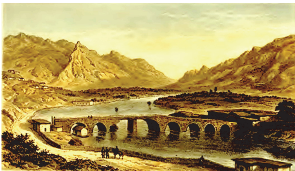
Fig. 5) The Engraving drawn by Bartlett in 1836 (Yurtsever 2018, 43)

The fifth span in the center of the Misis bridge exhibits a different form than the rest of the arches. This span has a form between that of a circular and a pointed arch. It is known that this form, called parabolic arch, was used in Ottoman architecture 34 . At this point, the writings of Langlois and an engraving by the English painter Bartlett explain why the aforementioned span has a different design from the others. Langlois states that Ibrahim Pasha of Egypt blew up an arch of the bridge while retreating. Also in these writings, it is told that the exploded arch was not repaired for a long time and that temporary solutions were devised to cross over the bridge 35 . The engraving drawn by Bartlett in 1836 provides an answer to the question of what the temporary solution was. In the said engraving, it is seen that the section where the fifth arch was located is covered by a wooden setup (Fig. 5).