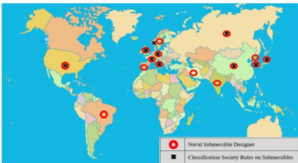
Fig. 1 Countries of naval submarine designers and having "underwater" class rules

Being adapted from the surface vessel rules, this situation is also valid for the underwater rules for maneuvering. Moreover, until the last few decades underwater operations attracted much less attention due to their technical and financial difficulties.