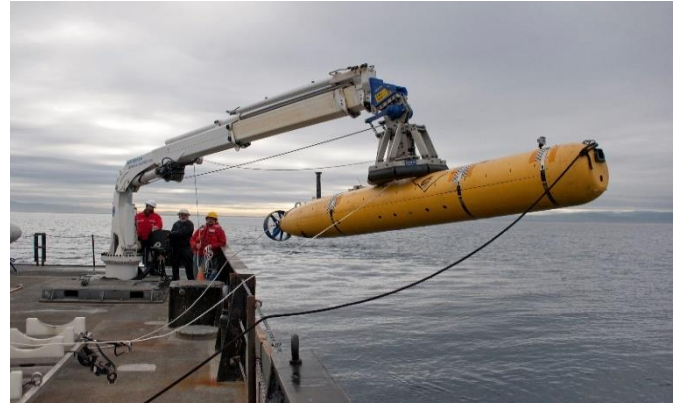
Fig. 2 An AUV

The evolution of underwater rules is also nurturing by the growing utilization of underwater vehicles for non-military purposes (i.e. merchant, scientific, leisure etc.). Examples of these type of vehicles are shown in Figure 2, 3 and 4. Classification societies are forced to regulate also this area of operation by generation of subcategories dedicated to each vessel type (tourist submersible, AUVs/ROVs, vessels for underwater cargo transportation etc.)