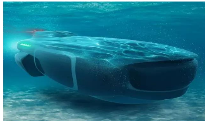
Fig. 3 A cargo submarine concept

The knowledge required to design such vessels can be considered as a byproduct of the design experience of major naval subsea systems.