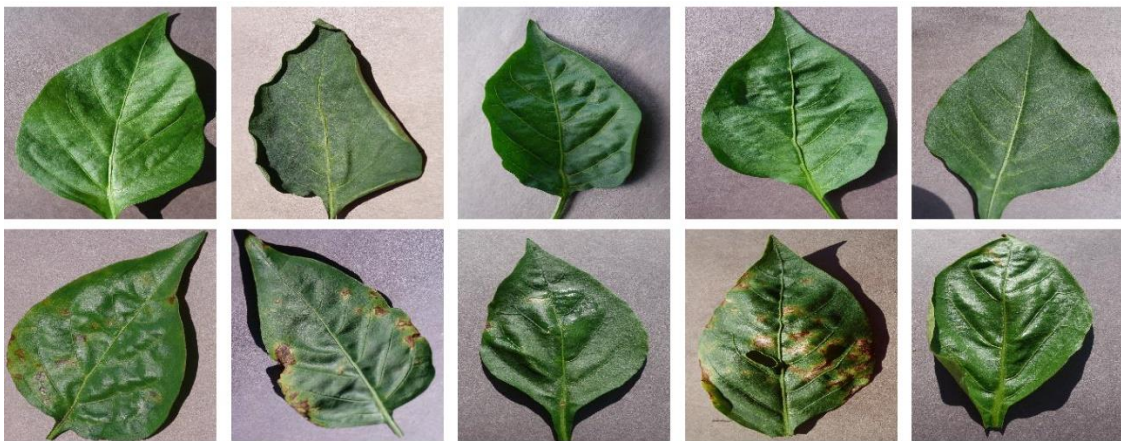
Figure 2. Sample healthy (top) and diseased (bottom) pepper leaves images

Under the concept of deep learning, a deep feature is the consistent response of a unit in the hierarchical model to an input. Convolutional Neural Networks (CNN) have multiple hidden layers and convolution core layers that deepen the network architecture [22, 23]. Features extracted from a CNN network are called "deep features." Deep features are the properties of the data obtained by passing it through a multi-layered artificial neural network and subjecting it to convolution processes. This answer contributes to the decision of the model. Unlike traditional feature extraction methods, deep features are obtained from fully connected layers of convolutional neural networks and can be used directly. On the other hand, deep features have been used in many researches and applications instead of features prepared by hand recently. Studies have proven that powerful features can be extracted using deep learning for operations such as object recognition and tracking. Thanks to these attributes, high success has been achieved in many applications such as object recognition, classification or tracking.