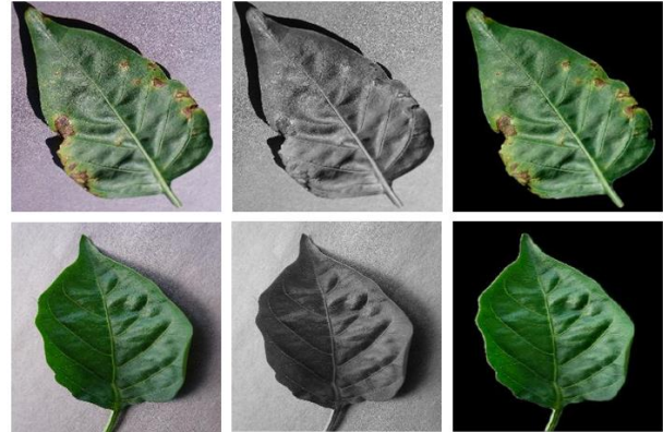
Figure 1. Color, gray and segmented leaf samples (Diseased-top and Healthy-bottom)

the scope of the study, the following data were given as input to the network (CNN model) in gray level, color level, and segmented forms. Segmentation [20, 21] may provide better feature characterization by omitting redundant image information from the image. Figure 2 shows healthy and diseased leaf images.